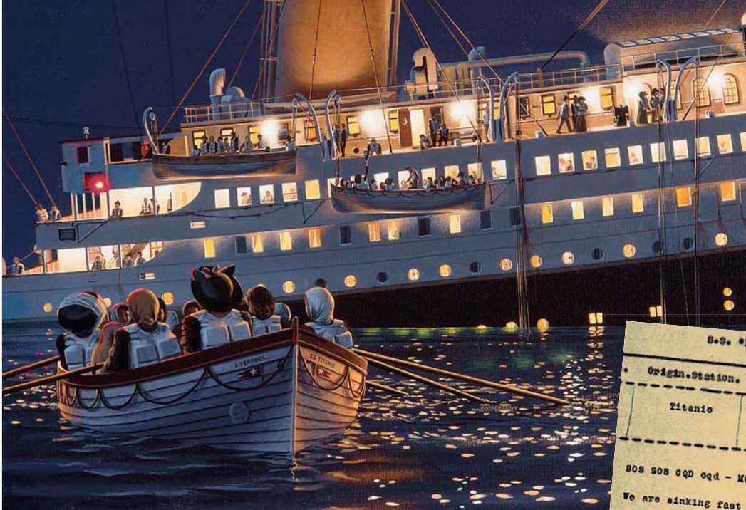
from Titanic, an Illustrated History, a Hyperion/Madison Press Book.

This telegraph message was sent by Bride and Phillips as a call for help.