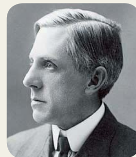
Ernest Lawrence Thayer 1863–1940

Although Ernest Lawrence Thayer wrote many poems for newspapers, he is remembered for just one: “Casey at the Bat.” Thayer was educated at Harvard