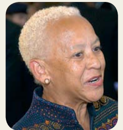
Nikki Giovanni born 1943

Nikki Giovanni: Storyteller Poet Nikki Giovanni gained popularity as a poet after the release of an album of her readings, Truth Is on Its Way . She says that in her poetry, “I use a very natural rhythm; I want my writing to sound like I talk.”